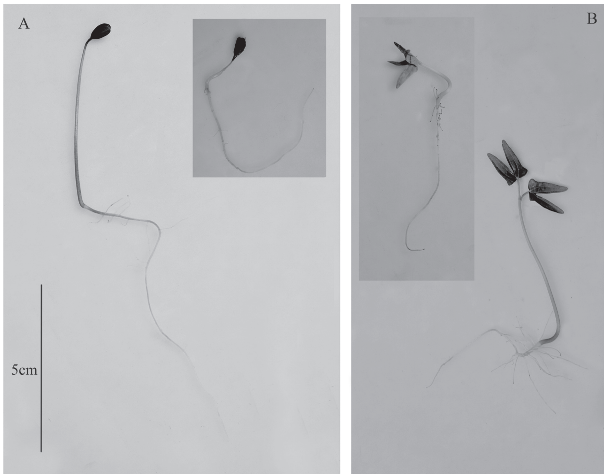
Figure 2. Euphorbia heterophylla L. (A) and Ipomoea grandifolia (Dammer) O'Donell. (B) seedling growth without (main image) and with (detail) contact with orange ( Citrus sinensis L.) peel essential oil.